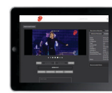
Cubix White Labelled web clients